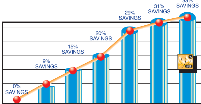
60 AFUE 64 AFUE 70 AFUE 80 AFUE 90 AFUE 92 AFUE 95 AFUE Percentage based on national averages; may vary according to efficiency of current unit and installation.